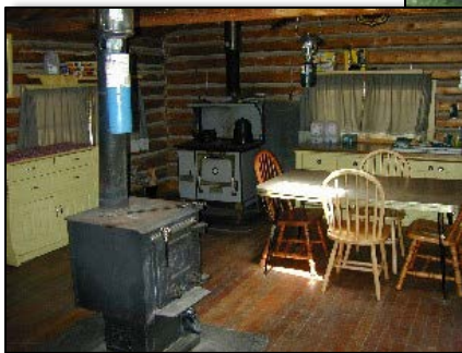
Bar Gulch Cabin