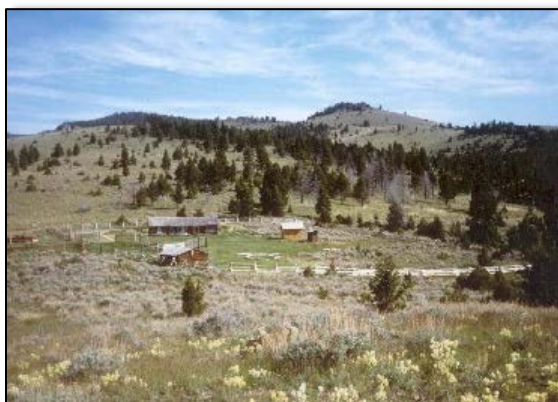
Eagle Guard Station