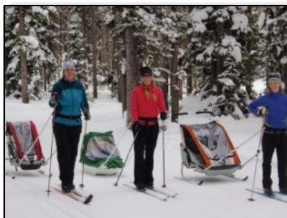
Nordic enthusiasts on Rendezvous Ski Trail