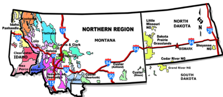
Northern Region Recreation Sites

A fee is charged at 20% of the Developed Recreation Sites in the Northern Region.