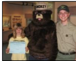
Junior Geologist Program participant and friends