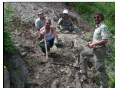
Workers repaired trail tread after spring rains.