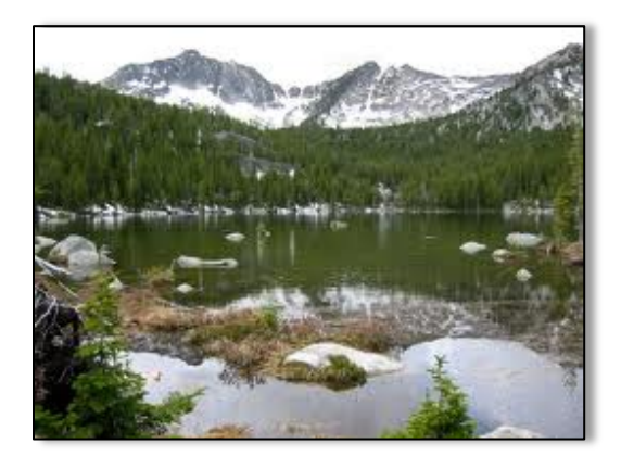
Dakota Prairie National Grasslands Images from the Grassland