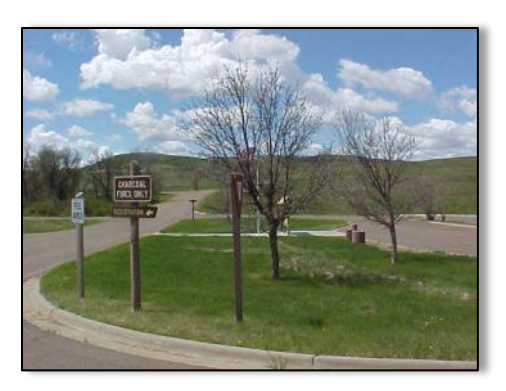
Buffalo Gap Campground