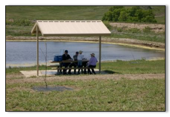
Grand River Picnic Area