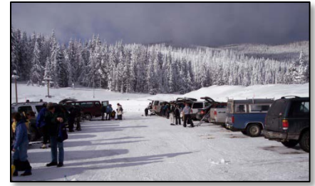
Lolo Pass Winter Recreation Area parking was maintained in partnership with Montana Highway Department.