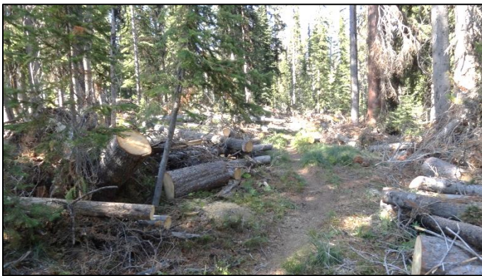
Fallen trees were cleared to open trails in the spring.