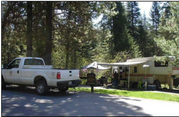
Laird Park Campground host site