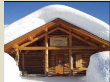
Clearwater National Forest Revenue & Expenditures

Can't decide between Nordic skiing and snowmobiling? Spend a day at Lolo Pass Winter Recreation Area and you can do both! Not only will you find groomed ski and snowmobile trails, but also a warm and welcoming visitor center. In 2011, recreation fees funded trail grooming, avalanche monitoring, informational signing, and staffing at the visitor center.