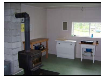
Wall Creek Cabin's refurbished interior