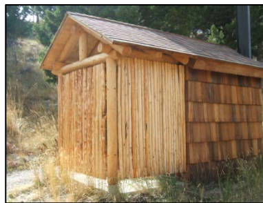
New privacy screen on Horse Prairie Cabin's outhouse