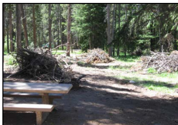
Removal of beetle-killed hazard trees and brush clean up continue to be high priorities in developed recreation sites.