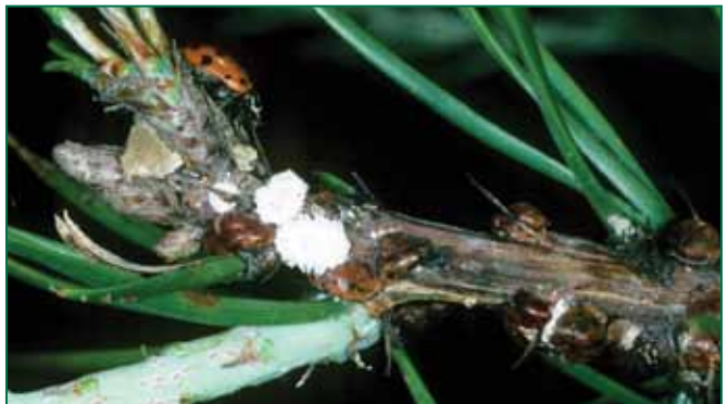
Figure 8. Ladybug adult and two larvae feeding on pine tortoise scale infestation.

A variety of predators feed on the pine tortoise scale. Adults and larvae of the ladybugs Hyperaspis signata (Olivier), H. congressis Watson, H. binotata (Say), Coccinella transversoguttata Faldermann, C. trifasciata Mulsant, C. novemnotata Herbst, Chilocorus stigma (Say), Hippodamia convergens Guérin-Méneville, and Scymnus lacustris LeConte have been observed feeding on the scales (Figure 8). The larva of the pyralid moth Laetilia coccidivora (Comstock) can destroy most of the female scales on an infested shoot. The caterpillar surrounds the settled females with webbing and consumes all but a portion of their hemispherical