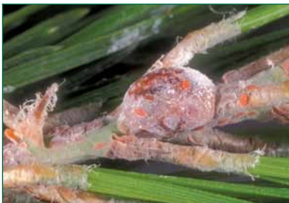
Figure 1. Pine tortoise scale female with mobile and settled crawlers.

In the United States, the pine tortoise scale is found in most states east of the Mississippi River. In the West it ranges from North Dakota south through Colorado, and also occurs in southern pines in Texas, Oklahoma, Arkansas, and Louisiana. This scale insect has also been reported from eastern and central Canada, as well as