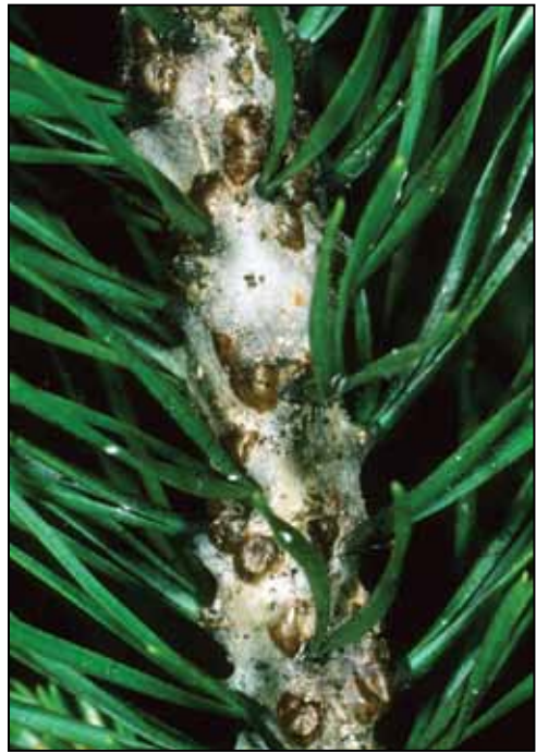
Figure 9. Webbing produced by Laetilia coocidivora larvae feeding on pine tortoise scales.

Predators and parasitoids usually maintain pine tortoise scale populations at low levels in its native range. The pine tortoise scale is considered a secondary pest, and heavy infestations are generally a result of a disruption of the natural enemies by insecticides, dust, or climatic conditions. Aerial insecticide applications targeting other insect pests can promote scale outbreaks. Once infestations develop, insecticide applications should be suspended