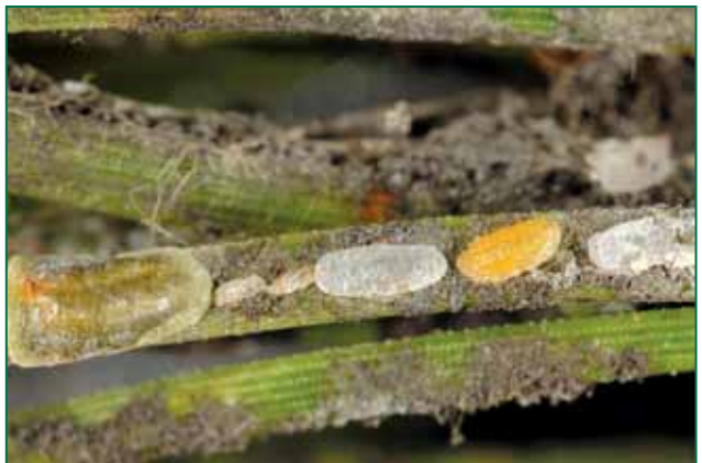
Figure 4. Empty test of a male pine tortoise scale (center) and needle form female (left).

The male and female crawlers both settle on the same part of the host pine, either the shoots or the needles. The sex-