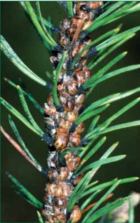
Figure 6. Pine shoot heavily infested by the pine tortoise scale.

Once the crawlers have settled, the males secrete a test. The males develop quicker than the females. When males reach the adult stage, they back out from the test and crawl or fly to find mates. Mating occurs in the fall in areas with one generation per year. The males mate with immature females and can mate with several partners. Males are short-lived, usually surviving one or two days.