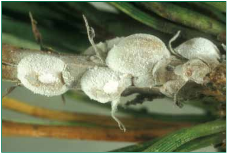
Figure 3. Females on the shoot covered with white wax.

In areas with colder winters, the scales overwinter as fertilized, immature females. In the spring, the females develop into adults. Egg production begins after the first growth flush of the host pine. The eggs are laid singly or in short chains, and are kept beneath the body of the female. Females produce approximately 500 eggs.