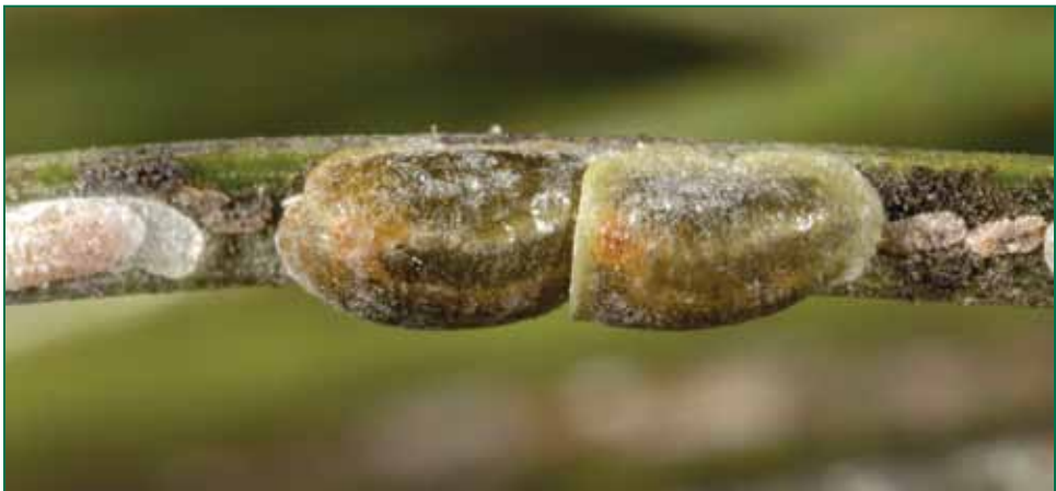
Figure 2. Needle form of female pine tortoise scale (center), with male inside test (left).

First instar male nymphs are indistinguishable from the female crawlers. When settled, they become elongate and secrete a white wax covering called a test (Figure 4) in which the subsequent stages develop. Males are