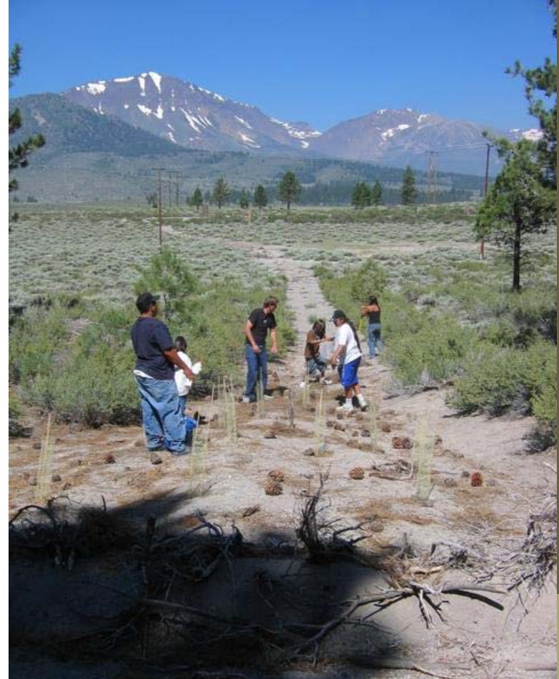
Volunteer Project Near June Lake, Inyo NF