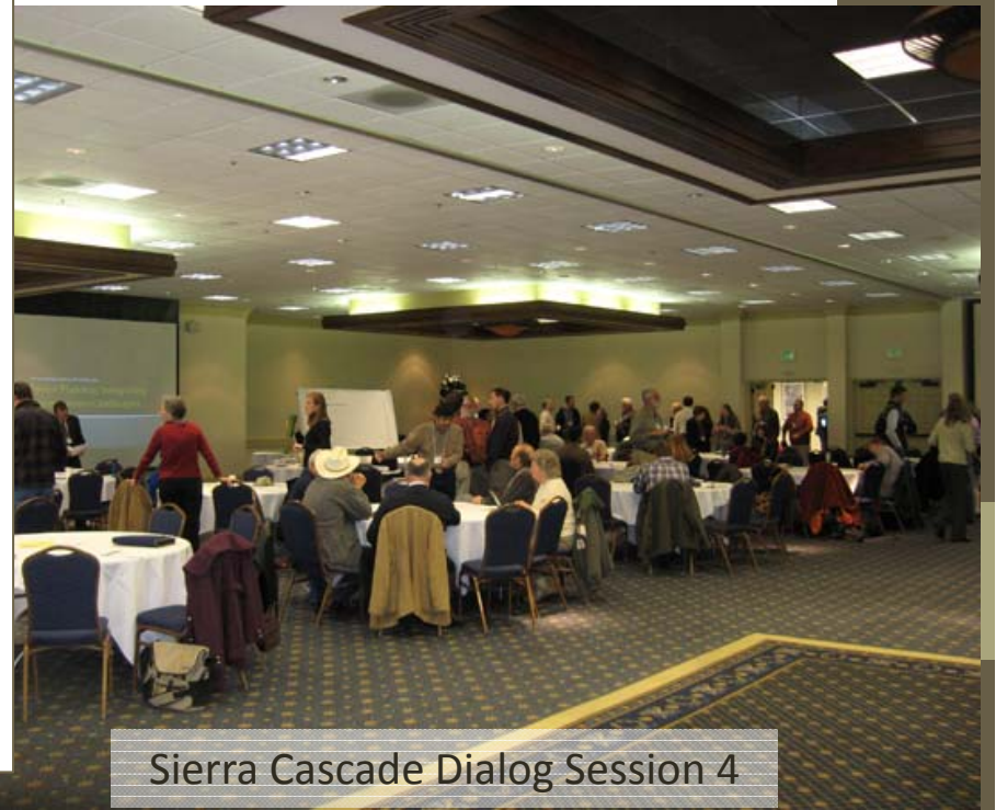
Sierra Cascade Dialog Session 4