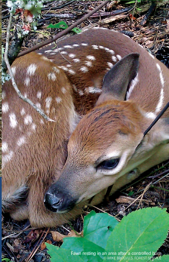
Fawn resting in an area after a controlled burn