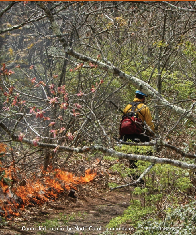
Controlled burn in the North Carolina mountains