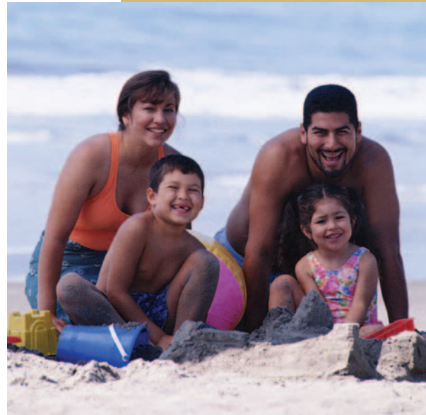
Many Hispanic outdoor recreationists continue to retain traditional Hispanic family values regardless of how long they have lived in the United States.

Californians are using advances in technology and transportation to expand their outdoor recreation opportunities. Californians love personal vehicles and outdoor recreation gear. They use both to expand their outdoor recreation opportunities. California's expansive road system provides access to far-flung destinations, and vehicles of every imaginable size and shape routinely hit the road in search of scenic vistas or active adventures. Once Californians arrive at their destinations, they set off on muscle-powered, mechanized, or motorized outdoor recreation equipment for further adventures and exploration. All-terrain equipment and navigational aids (e.g., Global Positioning System units, customized digital mapping software, and cellular phones) allow more people to go farther faster than ever before. All this equipment-aided outdoor recreation is costly to the consumer and to service providers. Though pursued in natural places, mechanized and motorized outdoor recreation, in particular, require infrastructure in the form of trails and staging areas. They also require a different style of management for visitor safety, noise, user conflicts, and environmental disturbance. This is a growing area of outdoor recreation and a cause of user conflict and managerial concern.