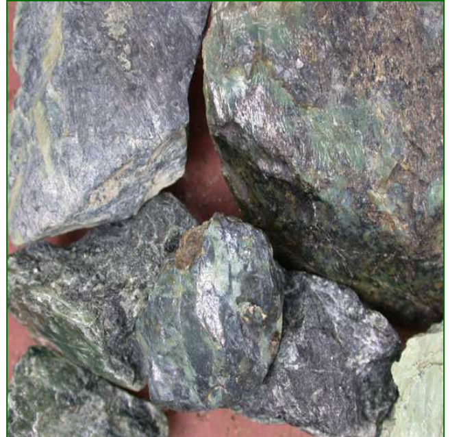
Examples of Serpentine Rocks

When these fibers are inhaled, over time they may