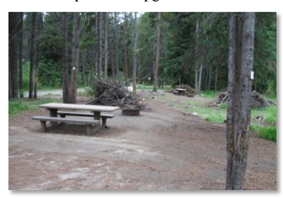
Bark beetle mortality prompted intensive hazard tree removal.