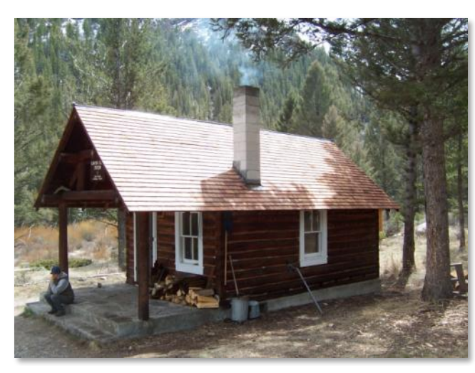
Workers installing a new shake roof at Moose Lake Cabin.