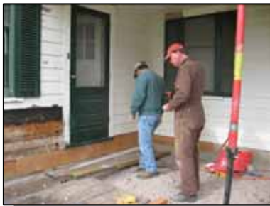
Porch replacement on an historic structure