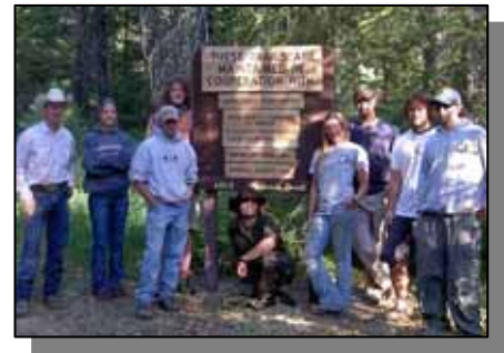
New cooperators sign