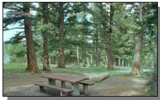
Campsite at Skidway Campground