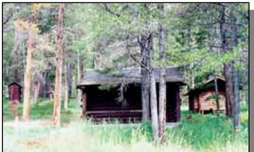
Kading Cabin Recreation Rental