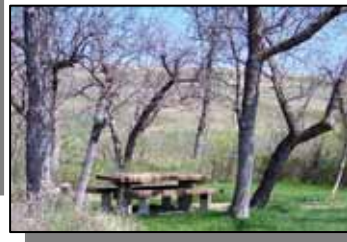
Buffalo Gap Campground