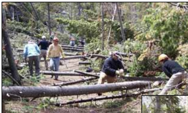
Before and after photos of trail clearing on the Beartooth Ranger District