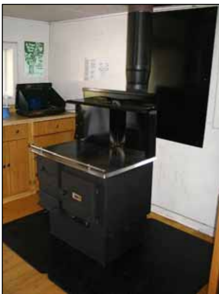
New cook stove at Moose Lake and West Fork of Rock Creek Cabins