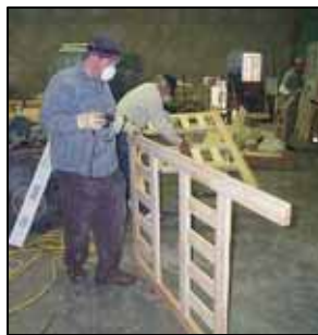
Building furniture for recreation rentals