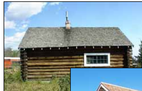
Wall Creek Cabin