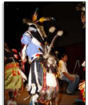
Two Medicine Dancers