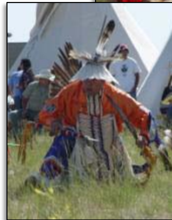
Blackfeet Cultural Interpretive Events