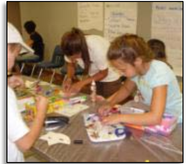
Children's Camp participants