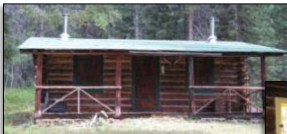
Kenck Cabin refinished exterior and interior