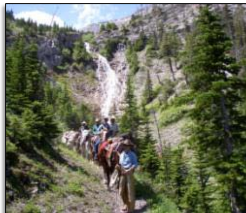
Horseback riders and guide near South Fork Teton Falls