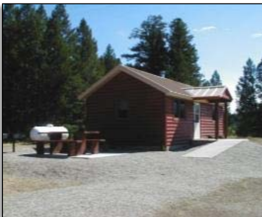
Calf Creek Cabin