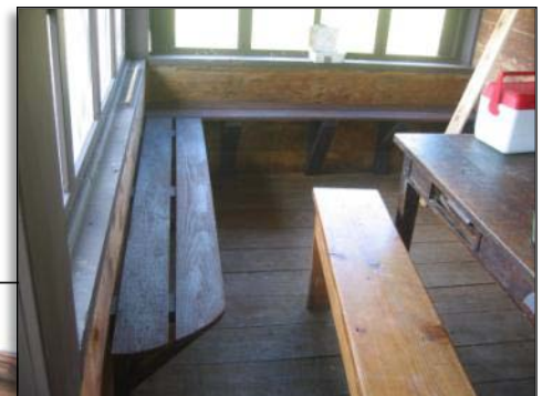
New benches on the rebuilt screened porch at Porcupine Cabin.