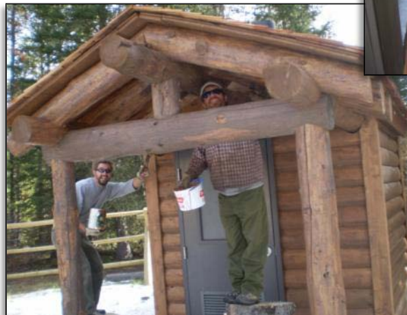
Workers finishing the historically compatible exterior of the Bennet Cabin toilet.