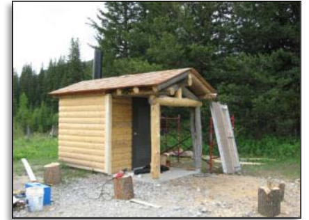
Restrooms with historically compatible exteriors at West Boulder and Porcupine cabins