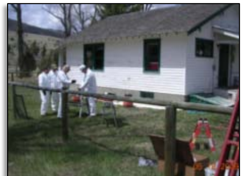
Removing lead paint and repainting Vigilante Cabin