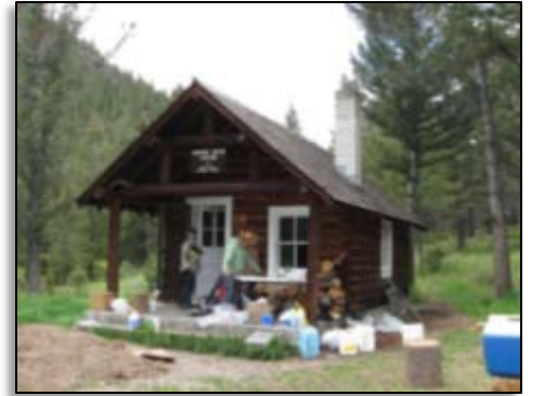
Canyon Creek Cabin work day