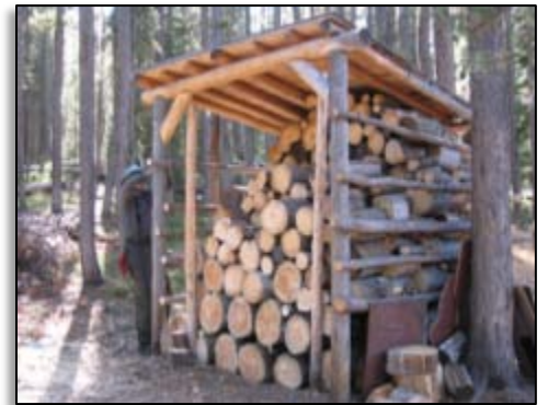
Stocking firewood at May Creek Cabin