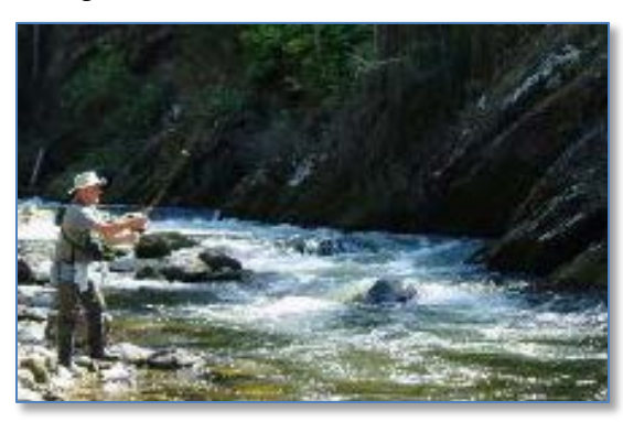
Fishing is a popular recreation activity on the forest.