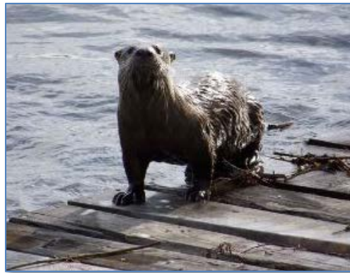
An otter is spotted at one of the Lolo's recreation areas.