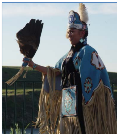
"Two Medicine Dancers and Singers" performed at the Lewis and Clark Festival.