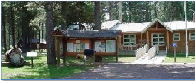
Lincoln Ranger District Office