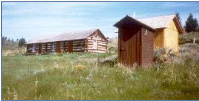
Eagle Guard Station