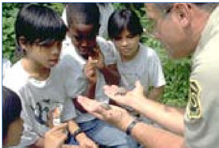
A Forest Service employee shares knowledge with young students.