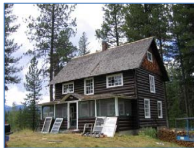
The Old Condon Ranger Station, before and after workers installed new shakes and rebuilt windows.