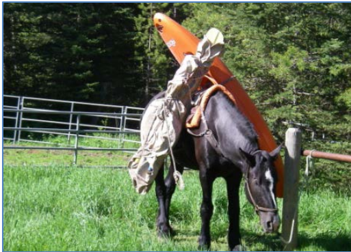
An outfitter and guide packs in a kayak for a river ranger.