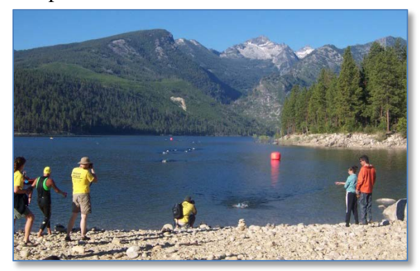
Lake Como Triathlon. REA funds can help to maintain lands and facilities for special uses.