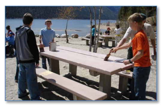
Youth volunteer at Lake Como Recreation Area.