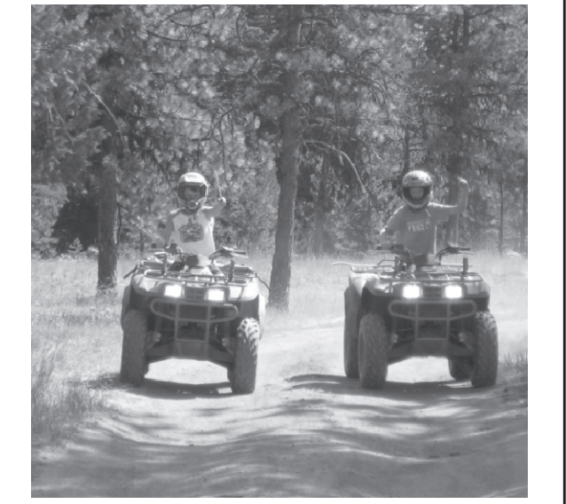
Walla Walla RD