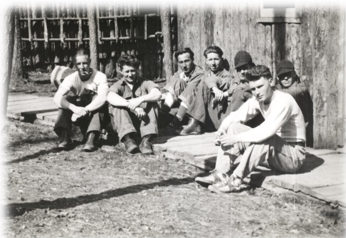
Cold Springs CCC Camp on Lake Jeanette c. 1934-1935.