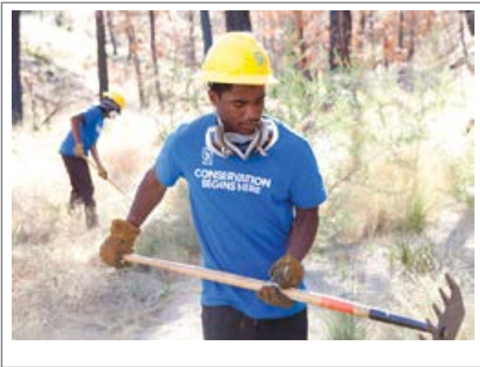
The Student Conservation Association (SCA) is one of the many partners that help restore California's National Forests. On the Angeles National Forest, SCA students restore a trail as part of a partnership called the "Angeles Wildfire Recovery Project."

As we work toward the goals outlined above, we will learn and adjust as we go. Over time there will be new science, new ideas, and new collaborations that will improve our understanding. With this new understanding, we will make course corrections in policy and practice and move even more efficiently toward our overall goal of resilient forests and wildlands.