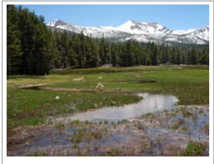
Meadow restoration in Sierra Nevada high country retains water and extends the benefits it provides. Lake Tahoe Basin Management Unit.

Ecosystem services are the goods and services that flow from wildlands and forests that are valued and used by people, and that directly or indirectly support human well-being. Wildlands and forests are valued for basic goods, such as wood, fiber, and water, but these ecosystems also deliver important services that are perceived to be free or limitless such as air and water purification, flood and climate regulation, biodiversity, scenic landscapes, wildlife habitat, and carbon sequestration and storage. The National Forests are important providers of ecosystem services to humans