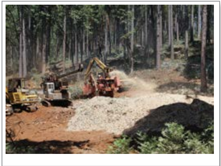
A wood chipper processes woody biomass from a restoration thinning project, Mt Hope Stewardship Project, Plumas National Forest.