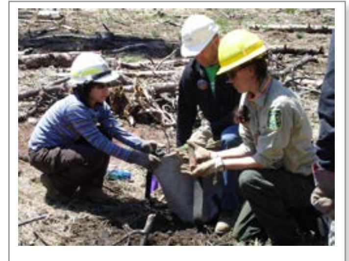
Reforestation with community stakeholders following a wildfire.