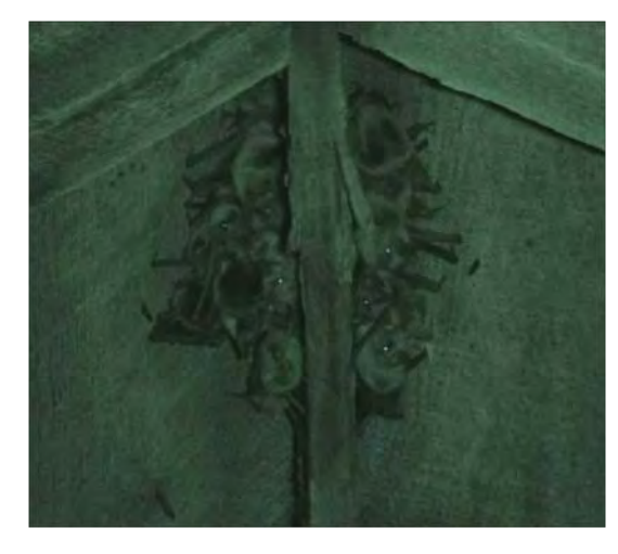
For more information, please contact:

Then you have a night roost where bats hang to rest and/or hang to pull inedible parts off of insects before eating them. Discouraging bats from roosting at night is easy; plug in electronic bat repellers on each side of your house, pointed up toward the eaves where bats can roost. These devices are available from your local hardware store and are guaranteed to work.