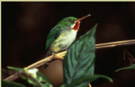
Puerto Rican Tody, Todus mexicanus

Number of annual forest visitors - 1,185,700