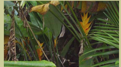
Gold Heliconia, Heliconia caribaea

1,000 acres (4 Km 2 ) or 3 % of the forest.