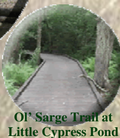
Ol' Sarge Trail at Little Cypress Pond