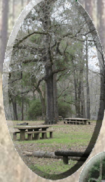
Fullerton Lake Recreation Complex