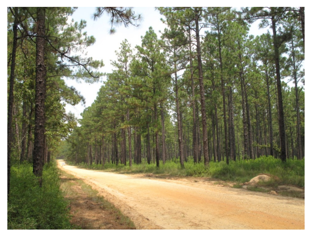
2010 Forest Road 201 Chickasawhay Ranger District De Soto National Forest National Forests in Mississippi