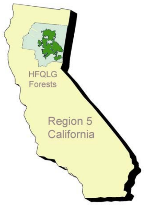
Figure 1 – The Herger-Feinstein Quincy Library Group (HFQLG) national forests.

The Quincy Library Group is a grassroots citizens' organization interested in the collaborative management of national forest lands. The core group represents the local community, environmental representatives, and the timber industry. In 1993, the group developed the "Community Stability Proposal" and eventually lobbied for the successful passage of the Forest Recovery Act in October 1998.