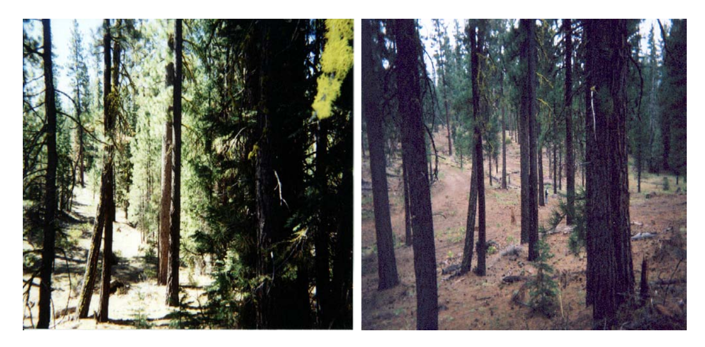
Figure 3 – Pre- and post-treatments on Herger-Feinstein Quincy Library Group Pilot Project area lands.