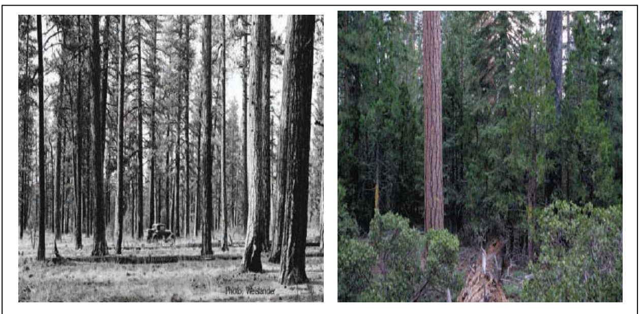
Figure 2 – The 1931 photo on left is typical of historic conditions found within the Herger-Feinstein Quincy Library Group Pilot Project area. The photo on right of the same forest shows the current dense conditions that often exist before any treatment.

As with most forests in the West, the forests covered by the Pilot Project produce both surface and canopy fuels faster than decomposition can recycle them. Surface fuels include downed, dead woody biomass and live and dead shrub and herbaceous material (Debano and others, 1998). Canopy fuels are aerial biomass primarily composed of tree branch wood and foliage. These fuels also include arboreal mosses, lichen, and hanging dead material such as needles and dead branches (Scott and Reinhardt, 2001; Reinhardt and others, 2006). In the absence of disturbance by fire, these fuels tend to increase.