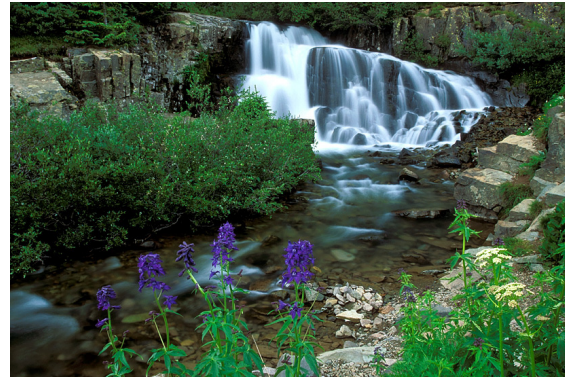
Larkspur and waterfall

Trail length: 1.5 miles. Open to: hikers and horses.