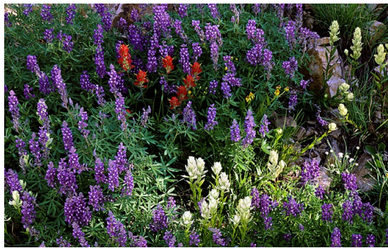
Lupine and Paintbrush