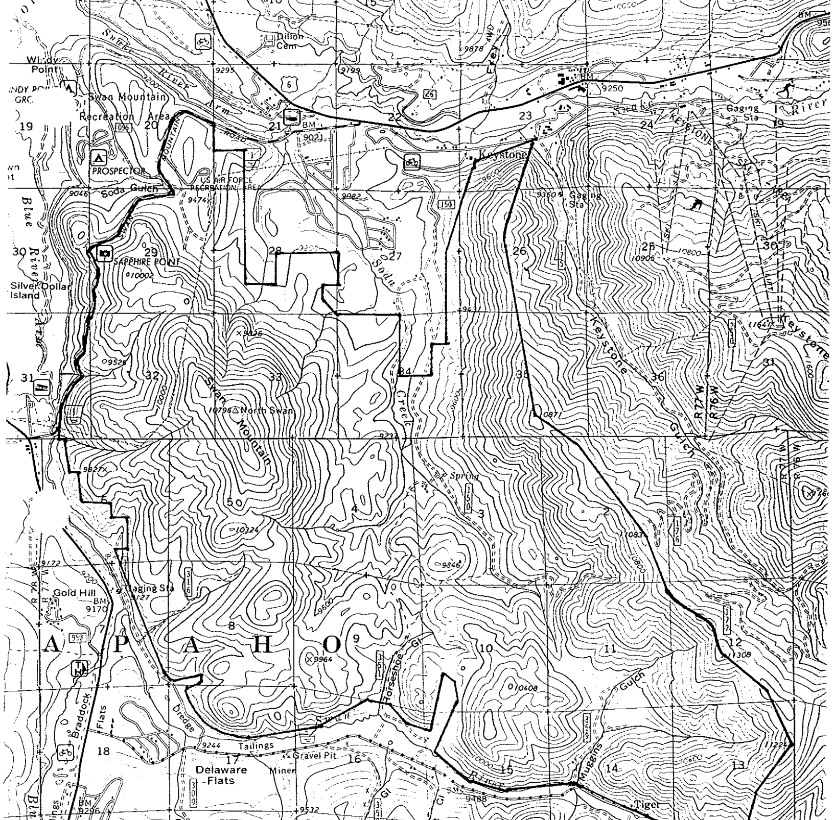
EXHIBIT A ORDER NUMBER 94-4

AREA INSIDE BLACK LINE CLOSED TO ALL MOTORIZED VEHICLES