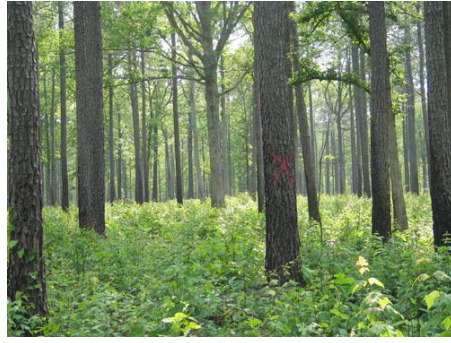
C126S12 Mulch site Dormant Burn