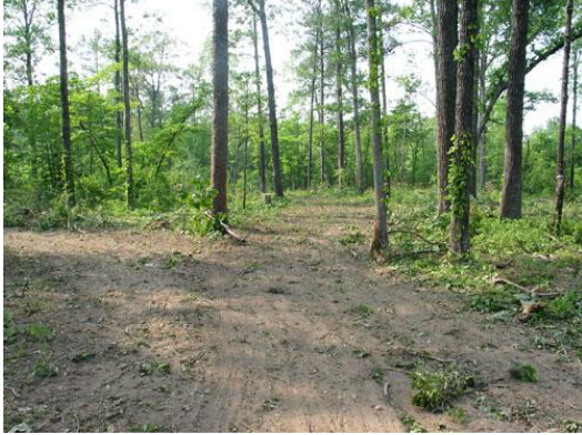
Walston Ridge Thinning