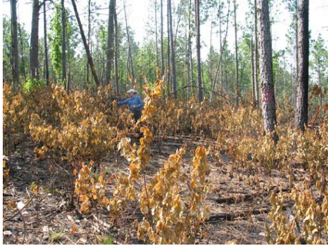
C148S10 Longleaf pine