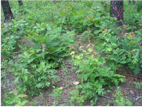
C126S12 Mulch site Dormant Burn - Maples