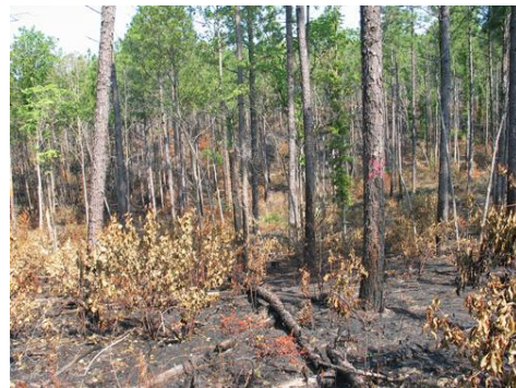
C148S10 Longleaf pine