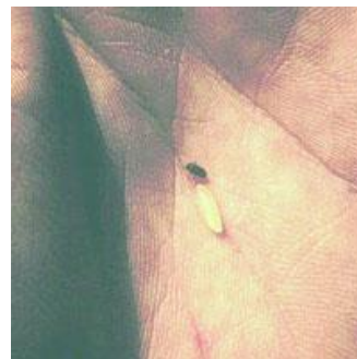
Southern pine beetle with a grain of rice for comparison in size.