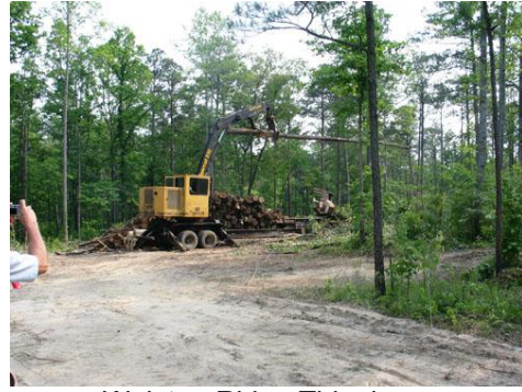
Walston Ridge Thinning