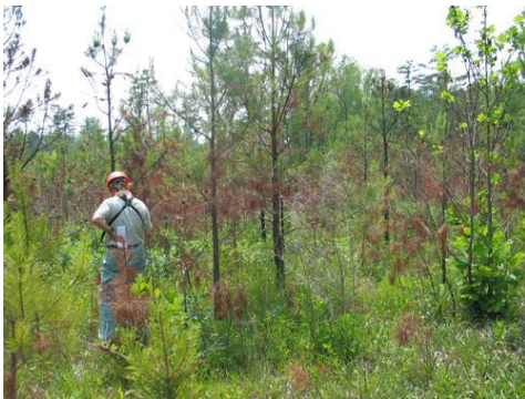
C127S22 Shortleaf Dormant Burn