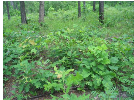
C126S12 Mulch site Dormant Burn