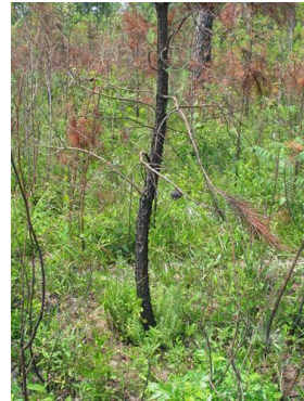
C127S22 Shortleaf Dormant Burn