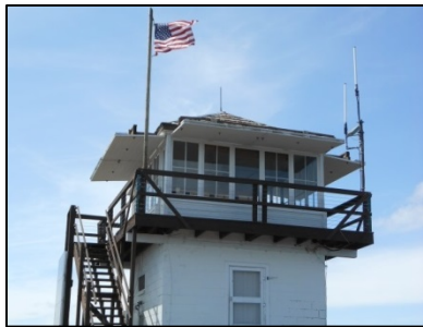
Little Guard Lookout received a new stairwell in 2014.

Heavy winter snow loads damaged a wooden stairway and railing at Little Guard Lookout, a popular rental cabin on the Coeur d'Alene River Ranger District. Revenue from cabin rental fees of $1,200 funded seasonal employees and other skilled laborers to construct a low-maintenance rock stairway to replace the damaged structure. The new stairway improves safety, and the use of native rock enhances the appearance of the site. Rental fee revenue also contributed to funding overall operations and maintenance of Little Guard and other rental cabins on the ranger district.