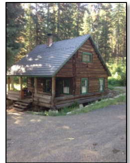
Adams Camp Cabin

Adams Camp served as a way station along the Milner Trail as early as 1862. The Forest Service established the area adjacent to Adams Camp as an administrative site in 1919. The old Adams Ranger's house, built in 1932, had been empty since the 1960s. The Forest Service, along with partners, began renovation of this historic building in 2003. In 2014, recreation fee revenue of $3,753 provided new screen and window frames and re-aligned and stabilized the cabin's sill logs and porch.