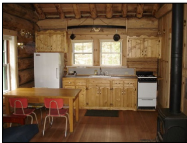
Interior of Kelly Forks Cabin

Sleeping up to six and equipped with a kitchen, propane stove, flush toilet and shower, Kelly Forks Cabin is located within an active Forest Service work center. Built in the 1930s, the cabin sits astride the beautiful North Fork of the Clearwater River and its tributary Kelly Creek, a prime fishing location and great place for swimming and tubing. Visitors enjoy amazing views up and down the rumbling river and into the surrounding evergreen forest while relaxing in the many modern comforts, such as electricity and plumbing, that this cabin provides. In 2014, recreation fee revenue of $5,695 resupplied the cabin and provided the maintenance.