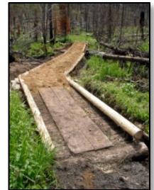
New turnpike on Gold Pan Cross County trail