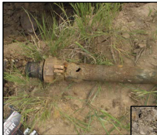
One lightning strike can create a lot of damage.

The trouble with an electric-powered water system is that so much more can go wrong ... especially when lightning hits. One well-placed bolt fried the electrical panel, blew up the well pump, and melted the well casing at Buffalo Gap Campground. This rendered the flush toilets, showers, and water spigots useless, giving 37-site campground only one vault toilet. Replacing the electrical panel, well pump, and casing cost nearly $20,000 of recreation fee revenue. The new $19,000 pressure pump is scheduled to be installed in spring 2015, also thanks to fee revenue support.