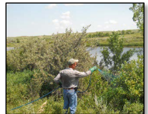
Botany technician sprays at Sather Lake Campground

Two field technicians worked hard to kill noxious weeds in developed recreation sites. Canada thistle and Absinth wormwood, two invasive non-native plants that threaten native prairie resources were treated according to manufacturer's specifications and Forest Service approved rates. Recreation fee revenue combined with appropriated funds covered salary, chemicals, and equipment. This ongoing work not only helps prevent the spread of these plants to other parts of the Grasslands but is required under North Dakota State law.