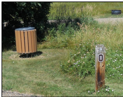
Trash cans such as this are no longer available at Buffalo Gap. Pack it in, pack it out is the order of the day.

Visitors to Dakota Prairie campgrounds are used to packing out their own trash; however the Buffalo Gap Campground was an exception. Garbage cans had been available, but proved to both be costly and actually invite trash to be dumped even when trash cans are not inside the holders. Using $3,000 of recreation fee revenue the trash can holders were removed and the campground joined the "Pack It In, Pack It Out" crowd. Since the removal of the holders, the campground has been much cleaner – bravo campers!