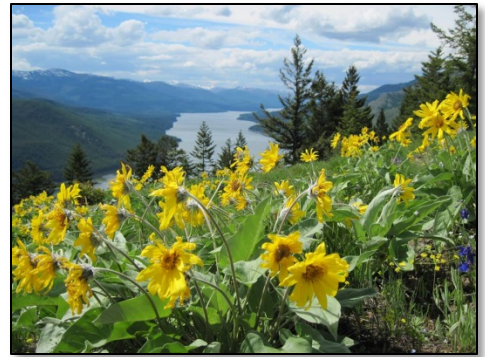
High view of the Flathead River.