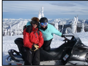
Snowmobiling at Warner.

The Forest has 180 miles of groomed snowmobile trails and thousands of play-area acres. Each year, recreation fee revenue provides about $12,000 to leverage partnerships with the State of Montana, snowmobile clubs, and outfitters and guides, who plow trailheads, put up signs, and provide maps and avalanche safety information.