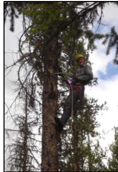
Intern secures phone lines high up in a tree.

In 2014, recreation fee revenue contributed $10,000 to provide a Montana Conservation Corps intern who hoisted 18 miles of phone line up off a trail. This preserves the line, and creates a safer environment for both people and wildlife.