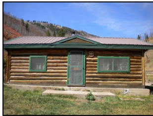
Bar Gulch Cabin