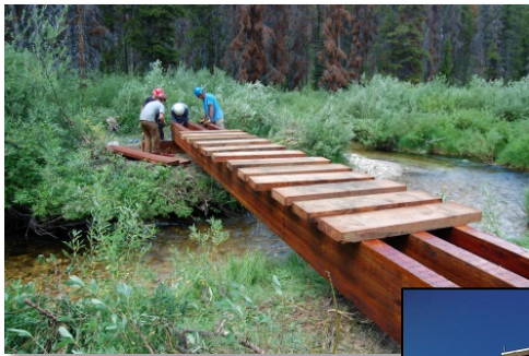
A new bridge protects a wet area