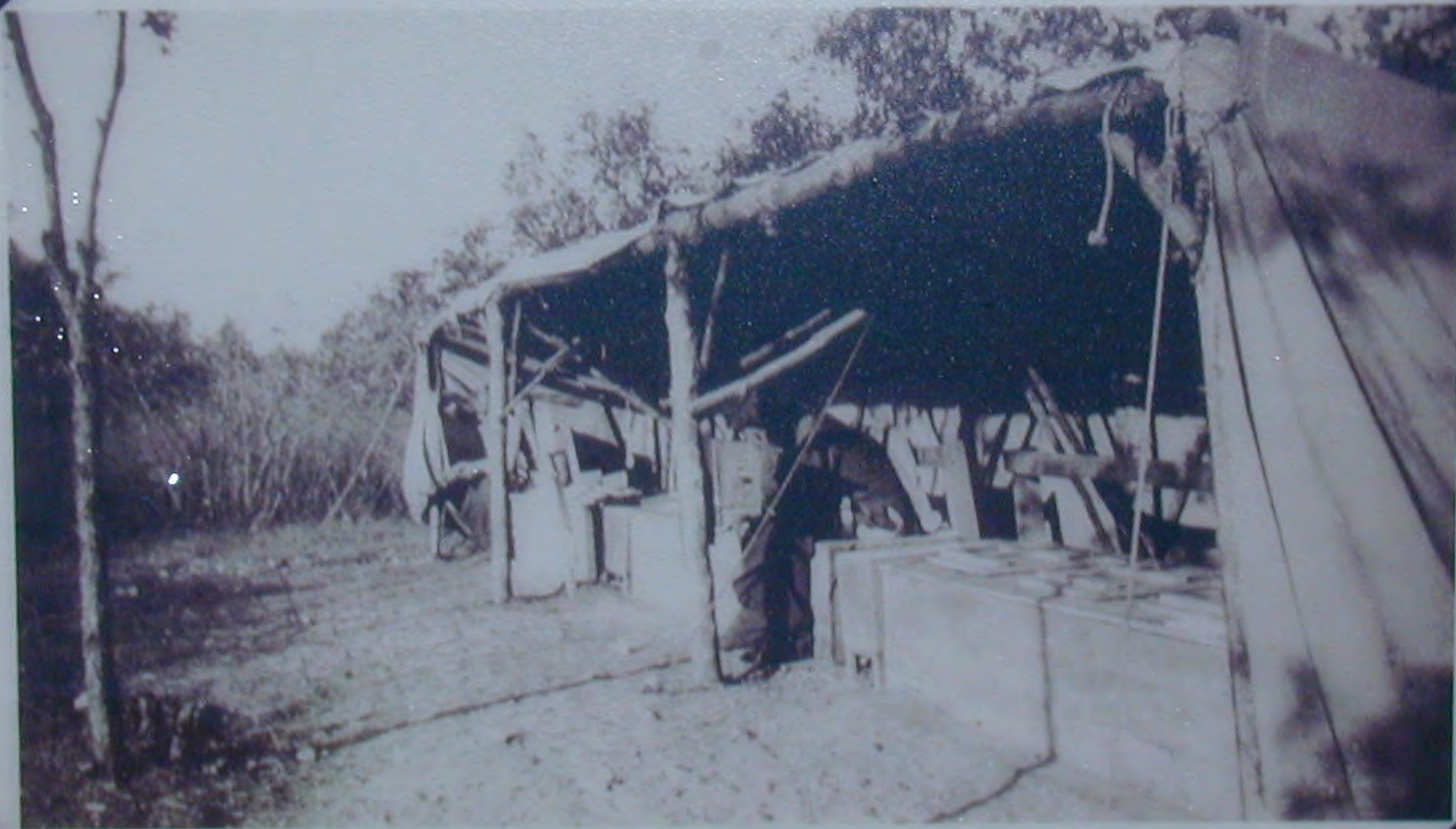
Eight seats, no waiting!