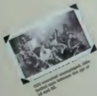
CCC workers reforestation, take and plant trees to replace the cut of the war.

This peacetime army worked hard to revitalize out land, water and air.