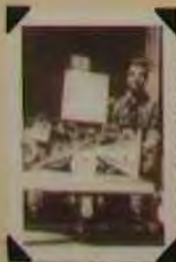
The men were paid $30 a month plus food, clothing and shelter. All but $5 was sent directly to their families.