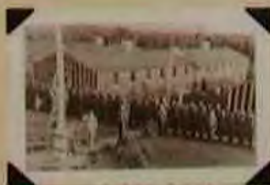
The Army ran the camp and kept strict discipline. The Forest Service was responsible for assigning work duties and supervising the men.

Even after a hard day's work, the men formed baseball, basketball, archery and swimming teams. Competition with nearby camps and the local community was common.