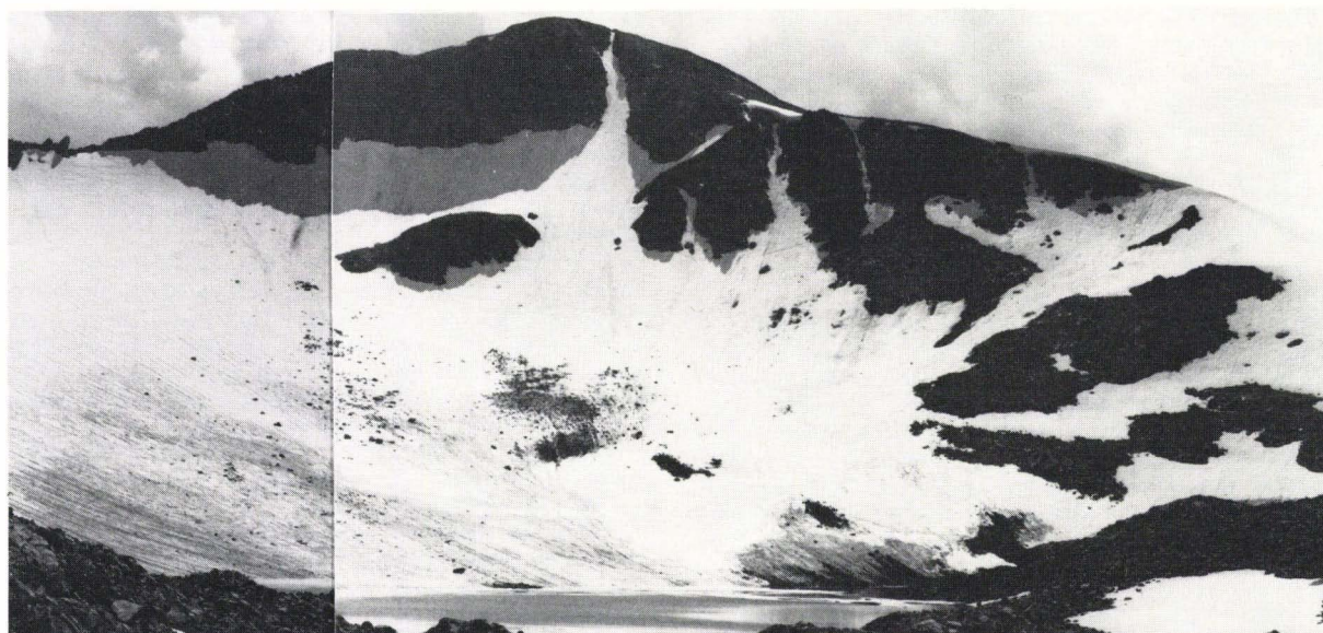
Fig.2. Photograph of Grasshopper Glacier, taken in 1981 by J.G. Ferrigno.

taken (see Figure 2) for comparison with Wilse's 1898 photograph. Aerial photography, taken two weeks later, showed that the glacier had melted into two separate smaller ice patches. The total surface area of the two parts was determined by planimetry to be approximately 0.425 \times 10^6 \text{ m}^2 .