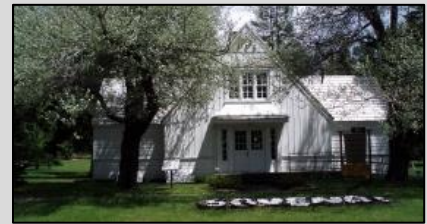
Lolo National Forest Revenue & Expenditures

A total of 47 volunteers worked with Superior Ranger District employees and a forest archeologist to continue restoration of Savenac Historic Nursery. Now available to rent, the nursery was established in 1907 and once produced 12 million seedlings annually. Visitors to the site will enjoy the beautifully landscaped grounds, interpretive trails and small arboretum.