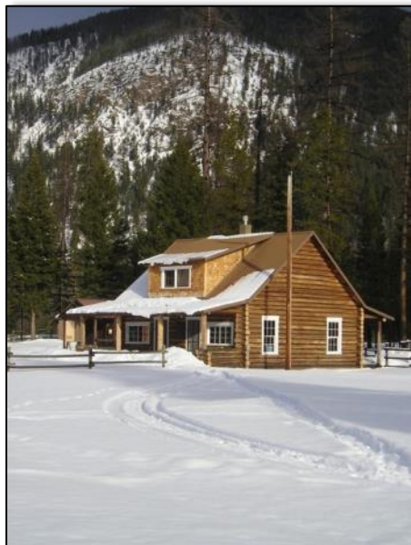
Monture Guard Station and cabin rental.