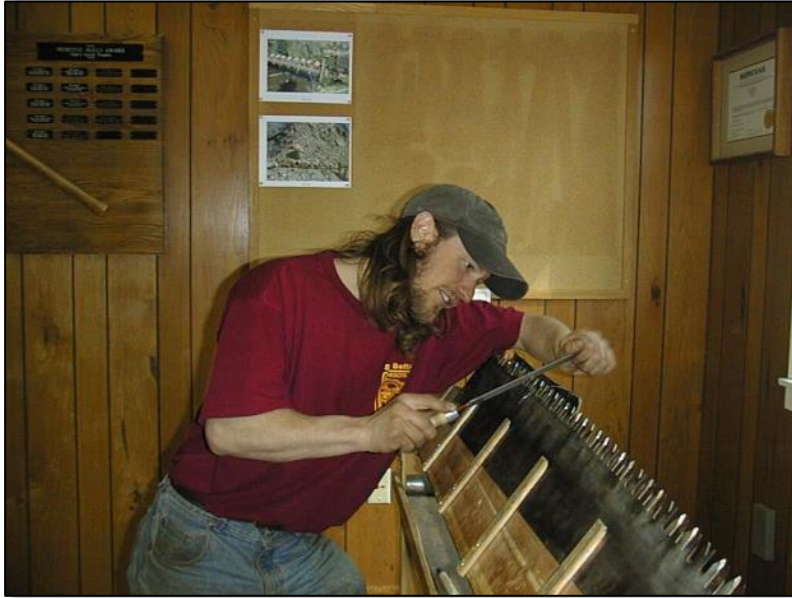
A student maintains a cross-cut saw.