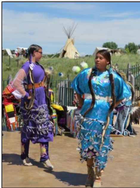
All Nations Dancers perform at the Annual Lewis and Clark Festival.

*Expenditures may be funded with previous years' revenue.