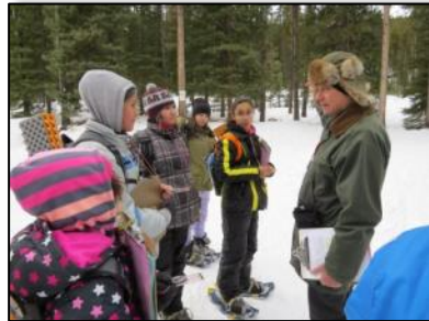
An employee teaches children about Winter Ecology at the Many Pines Campground.