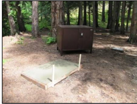
New bear-proof food storage boxes were installed at Yaak River Campground.