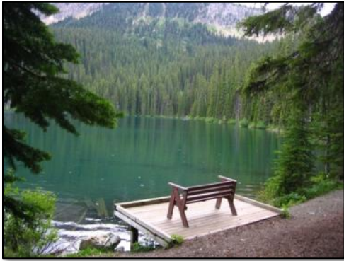
Little Therriault Lake