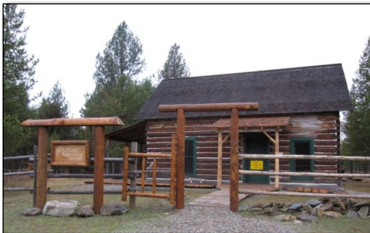
Bringing back to life a 106-year-old cabin: Fairview Ranger Station will become active in the summer of 2014.