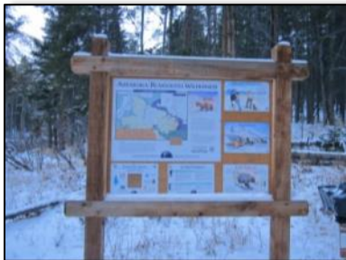
New bulletin board at an Absaroka Beartooth Wilderness trailhead.