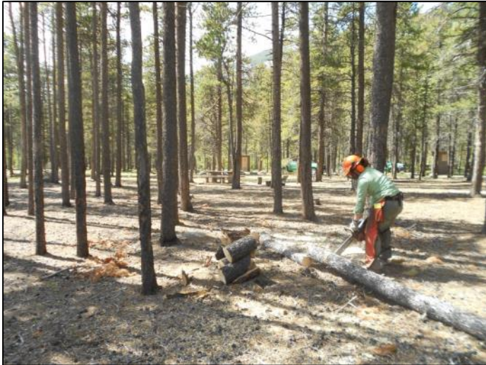
Hazard tree removal in Beartooth Ranger District campgrounds