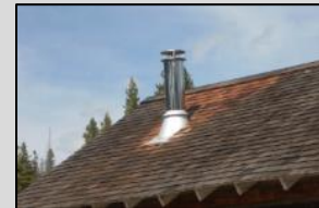
Beaverhead-Deerlodge National Forest Revenue & Expenditures

Fire safety is an important component of ongoing cabin restoration projects. Pictured below is a new chimney at Moose Lake Cabin. An improperly-sized stove pipe had been leaking smoke, allowing creosote to build up and damage the walls. Recreation fees are critical to keeping rental cabins in safe condition for visitors.