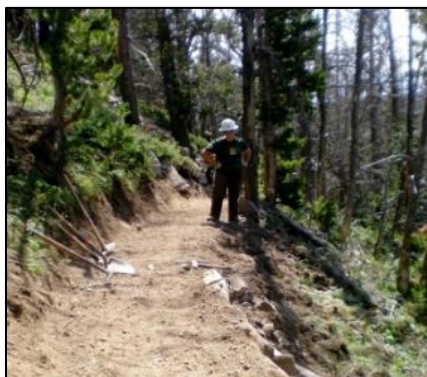
The Montana Conservation Corps helped restore the Madison Ranger District's Baldwin Parks Trail.

*Expenditures can be funded with previous years' revenue.