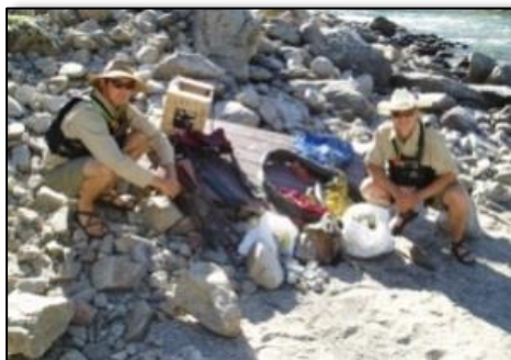
River rangers provide an important presence on the Wild and Scenic Salmon River. Recreation fees help fund rangers' supplies and work activities.